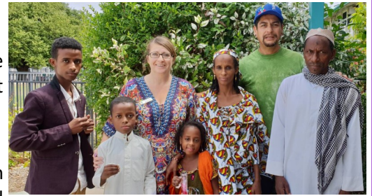
TMSG clients at a school enrolment.

A backpack with pencil case, drink bottle and lunchbox for young adults.