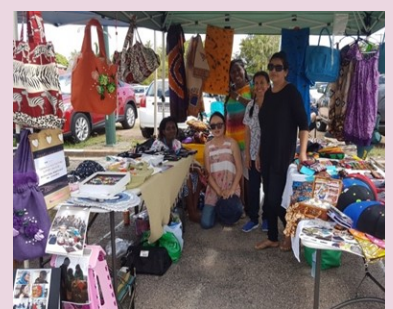
Drought Relief Market Day